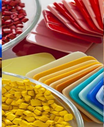
Rubber & Plastic Industry