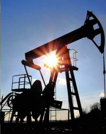
Oil & Gas Industry